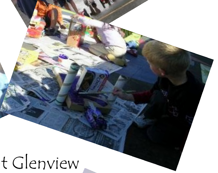
Life at Glenview